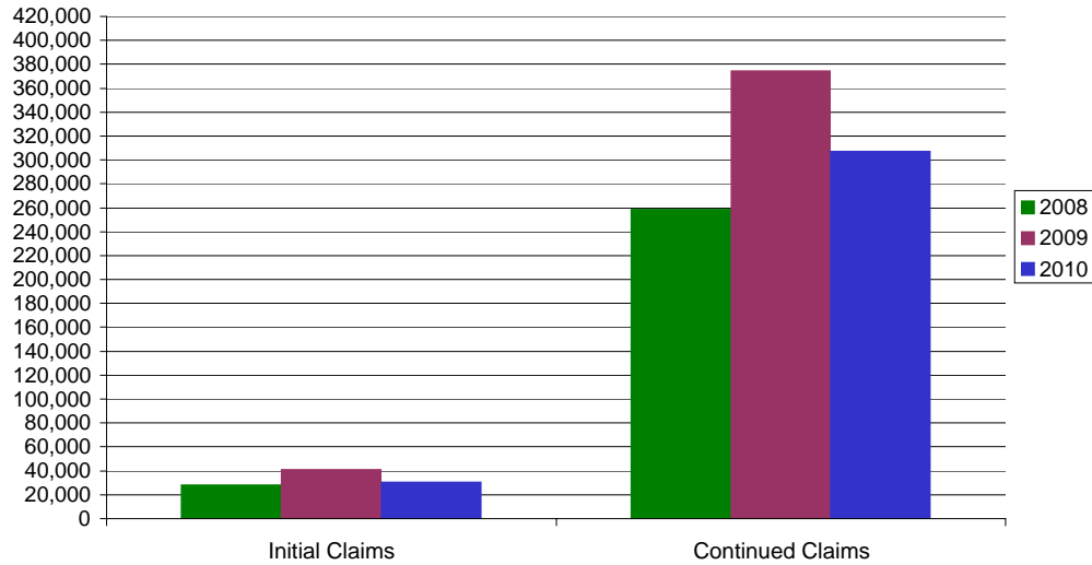
UI Initial Claims 2008 - 2010